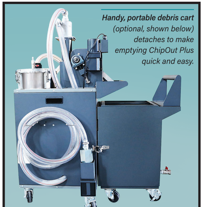
Handy, portable debris cart (optional, shown below) detaches to make emptying ChipOut Plus quick and easy.