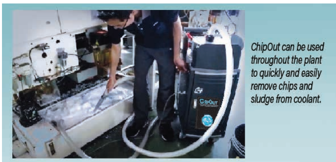
ChipOut can be used throughout the plant to quickly and easily remove chips and sludge from coolant.