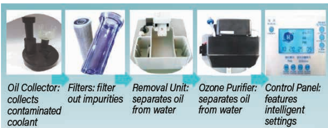
Oil Collector: collects contaminated coolant