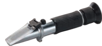
Refractometer Optical refractometer for quick fluid sample readings.