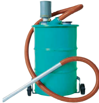
Drum Top Sump Cleaner™ Economical vacuum unit which converts an existing open-top drum into a powerful machine tool sump cleaner.