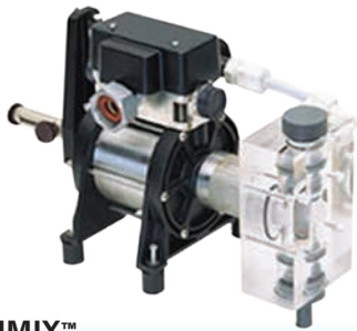
UNIMIX™ Water-driven, positive displacement proportioner dispenses coolant concentration on demand. Option for alkaline parts washing.