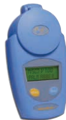
Palm Abbe® Digital Refractometer For fast, accurate, laboratory-precision readings in degrees Brix. Self-calibrating to water, ready to use in seconds. Easy-to-read display.