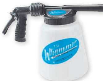
The Whammer™ Durable, low-cost dispenser for Master STAGES™ maintenance cleaners produces foaming stream for cleaning machine tools or large clean-in-place parts.