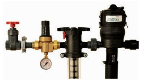
Mini Dos Compact, low- to mid-flow, fluid-driven proportional injector. Segregates harsh chemicals from critical internal components.