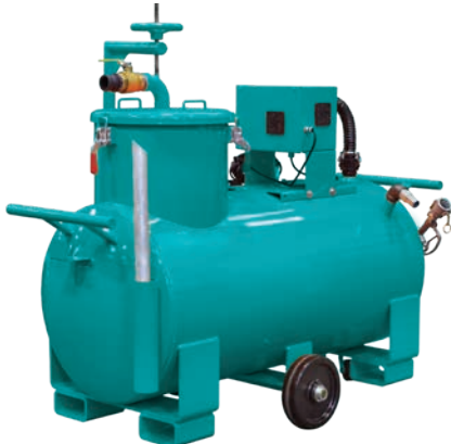
230VAC Electric Yellow Bellied Sump Sucker™ Cleans virtually any machine tool sump quickly by filtering sludge and chips from coolant. Available in multiple configurations, sizes, and power sources.