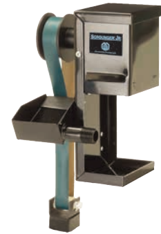
SCROUNGER™ Jr. Oil Skimmer Effectively removes troublesome tramp oil from coolant for longer sump and tool life, better surface finish, and cleaner machines and workplace.