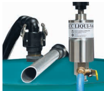
MCC Reversible LIQUI-VAC™ Sucks up tramp oils, used oils, and waste coolants- fast and simple. Can discharge fluids from drum to a separate container.