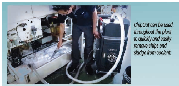
ChipOut can be used throughout the plant to quickly and easily remove chips and sludge from coolant.