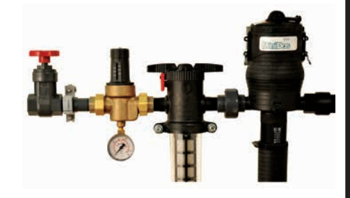
Mini Dos Compact, low- to mid-flow, fluid-driven proportional injector. Segregates harsh chemicals from critical internal components.