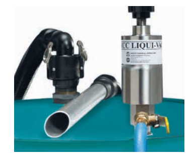
MCC Reversible LIQUI-VAC™ Sucks up tramp oils, used oils, and waste coolants– fast and simple. Can discharge fluids from drum to a separate container.