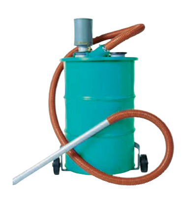
Drum Top Sump Cleaner™ Economical vacuum unit which converts an existing open-top drum into a powerful machine tool sump cleaner.