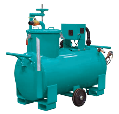
230VAC Electric Yellow Bellied Sump Sucker™ Cleans virtually any machine tool sump quickly by filtering sludge and chips from coolant. Available in multiple configurations, sizes, and power sources.