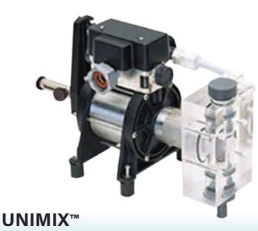
Water-driven, positive displacement proportioner dispenses coolant concentration on demand. Option for alkaline parts washing.